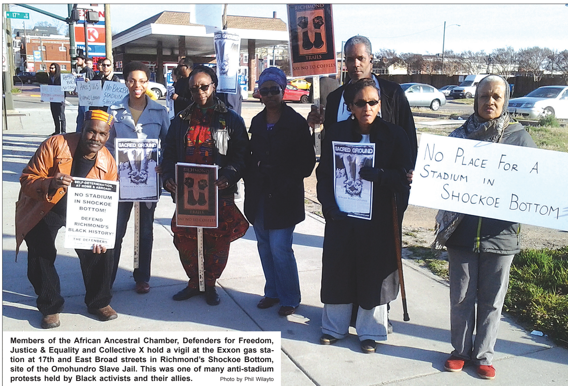
Members of the African Ancestral Chamber, Defenders for Freedom, Justice & Equality and Collective X hold a vigil at the Exxon gas station at 17th and East Broad streets in Richmond's Shockoe Bottom, site of the Omohundro Slave Jail. This was one of many anti-stadium protests held by Black activists and their allies.